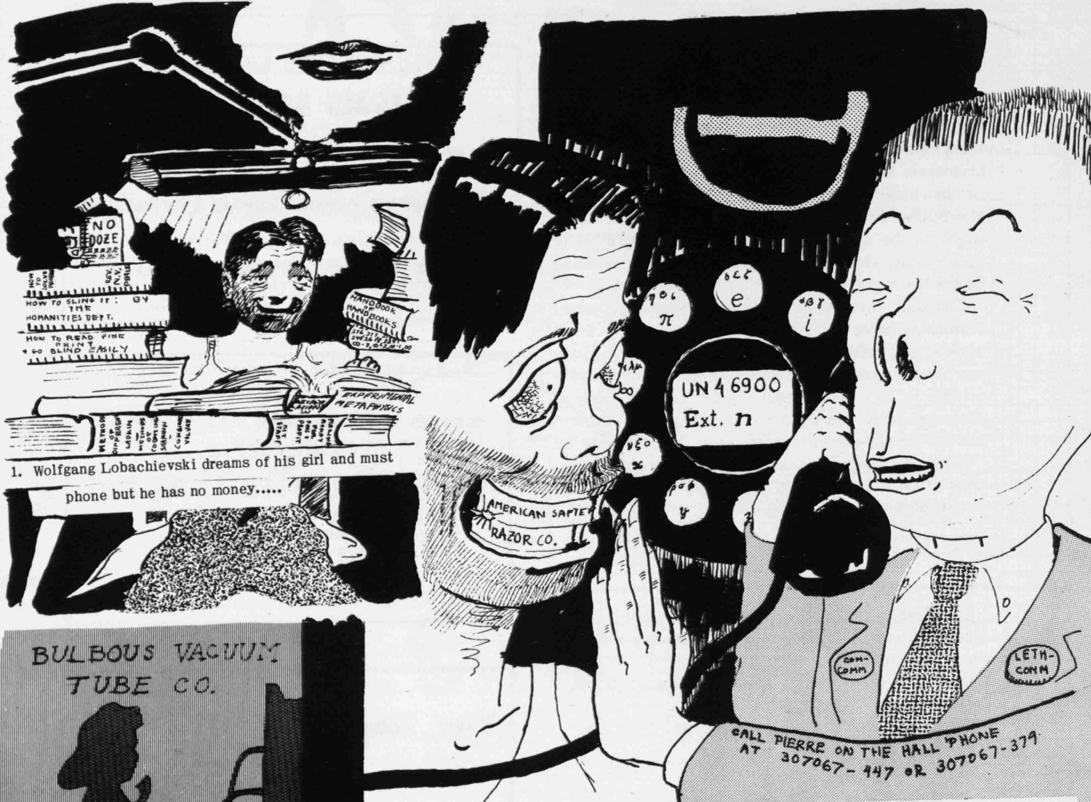
1. Wolfgang Lobachievski dreams of his girl and must phone but he has no money.....