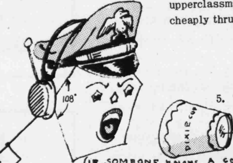
5. The pentagon, which connects to the audio line.

JUST KEEP READING ALONG THIS LINE, EVEN IF THE OTHER PEOPLE ON THE BUS THINK YOU'RE SLIGHTLY DRUNK, OTHERWISE YOU'LL READ THE END FIRST. (IF SOMEONE KNOWS A GOOD METHOD OF SHOWING THAT THERE IS A BOTTOM [AS IN "SHIRT BUTTON"] IN THIS CUP ON THE END OF THE STRING WITHOUT USING CUT-AWAY DRAWINGS, WHICH ARE PASSE AND OUT-OF-IT, PLEASE COMMUNICATE WITH THE ARTIST THRU THIS MAGAZINE, I CAN PROMISE THAT, SINCE YOU PROBABLY WON'T WRITE THIS LETTER UNTIL LATE IT WILL SIT AROUND THE OFFICE ALL SUMMER BEFORE I SEE IT, UNLESS YOU ARE A STRIKINGLY BEAUTIFUL GIRL, CIRCA 16-21, AND IF SO PLEASE INDICATE SO ON THE ENVELOPE, AS I'M A BUSY MAN) NOW THAT YOU'VE READ THIS, ARE YOU ANY HAPPIER? WELL NEITHER AM I, SINCE THIS PAGE WAS DRAN ONE FOURTH SIZE AND ENLARGED FOR PRINTING, AND SO I'M GETTING AN ANGRY LETTER WRITER