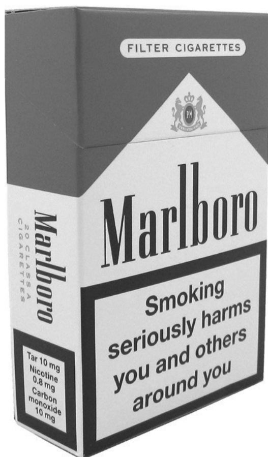
Figure 2 An example of EC/UK text-only warnings (2003).

information processing and improve memory for the health message.