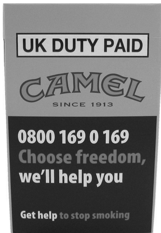
Figure 4 An example of supportive, cessation-oriented messages in the UK (2010).

Future research on tobacco health warnings should consider effective types of message content for pictorial warnings to a greater extent. There is a particular need to evaluate different themes or 'executorial styles', including the potential impact of